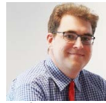
Oliver Burns County Insurance Wirral