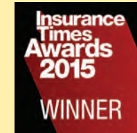
General Insurer of the Year