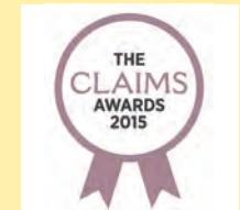
Claims Initiative of the Year Claims Fraud